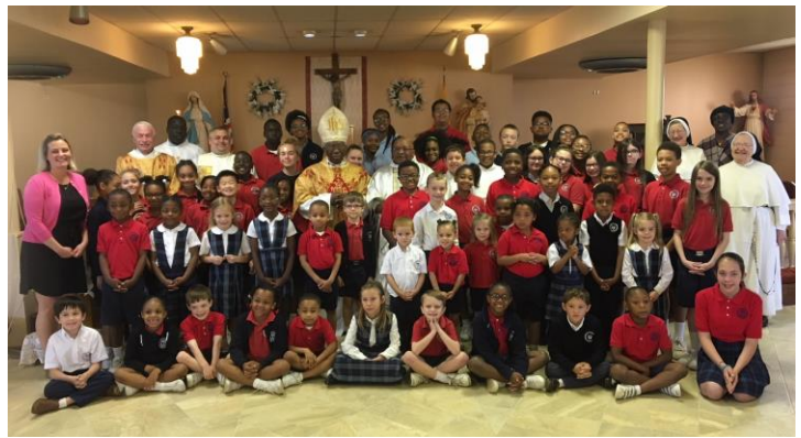
Cardinal Arinze's visit last Friday.