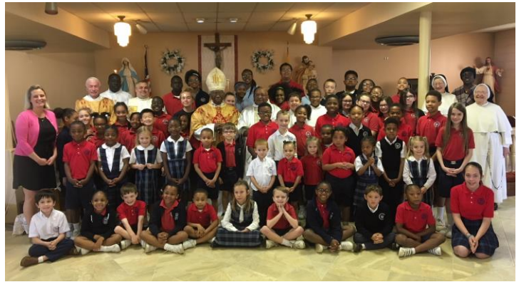
Cardinal Arinze's visit last Friday.